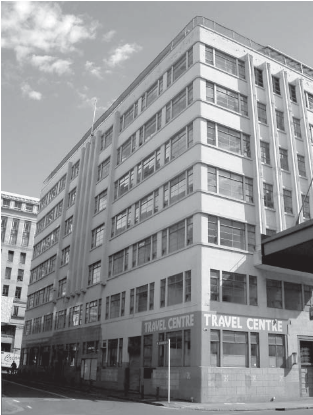
Jean Batten Building