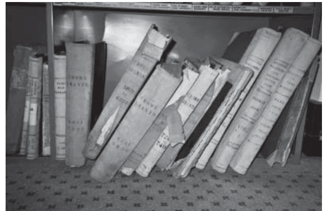
An incomplete set of Crown Grants at LINZ Wellington Processing Centre. (R. O'Brien)

research results clearly support electronic delivery and the move to 100% e-lodgement.