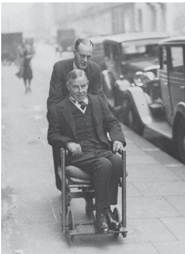
William Downie Stewart (1878–1949), lawyer and politician, in London in 1932.

Media reporting of these events is almost non-existent. The Press Gallery was deserted for the recent second reading of the New Zealand Sign language Bill. Yet one in five New Zealanders have an impairment, so while there is the occasional media reference to the disabled hero or victim, the coverage does not reflect any form of proportionality.