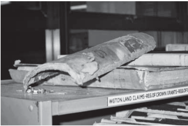
LINZ records in poor condition, Wellington Processing Centre