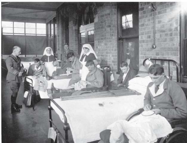
Returned servicemen embroidering as part of their convalescence c.1918.

Just days after the Sign Language Bill had its second reading, accompanied by silent acclamation of a large contingent in the gallery, National Radio's Nine to Noon featured a piece on the desirability of screening of babies for deafness and subsequent surgical cochlea implants for these new-borns. There was no mention of informed consent, undesirable medical side effects, or, most importantly, that these children might have a right to grow up participating in their own deaf cul-