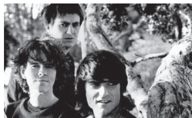
An early publicity shot of Flying Nun favourites The Verlaines.

The history page is reached from the main menu and opens with a lengthy but well-written (in 2003) history